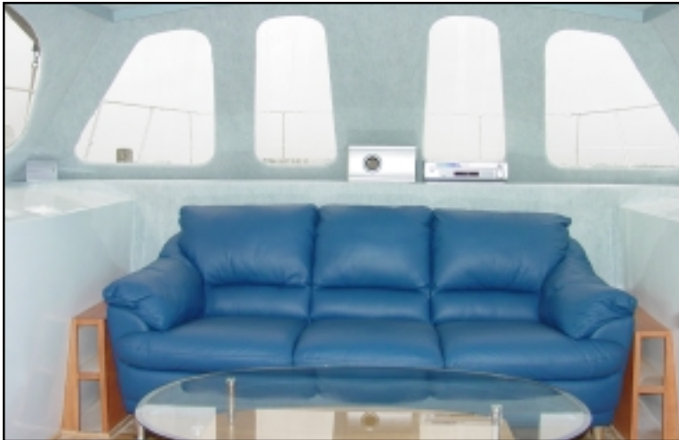
Fully customizable Main Salon ...furnish to suit personal preferences.

*All Prices Subject to Change Without Notice. FOB Merritt Island, FL USA 32952